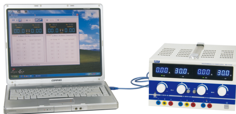
PC software control